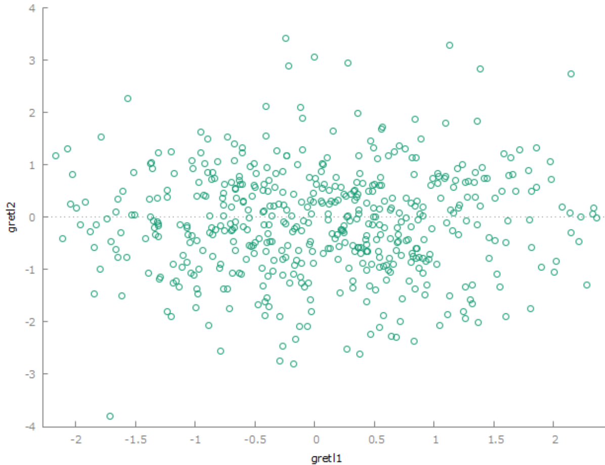
Figure 1: Scatter graph produced by gretl chunk

include_graph(chunk = "gretlR",graph = "scatter.png")