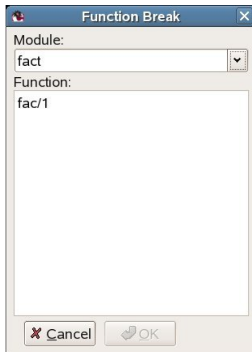
Figure 2.3: Function Break Dialog Window

A function breakpoint is a set of line breakpoints, one at the first line of each clause in the specified function.