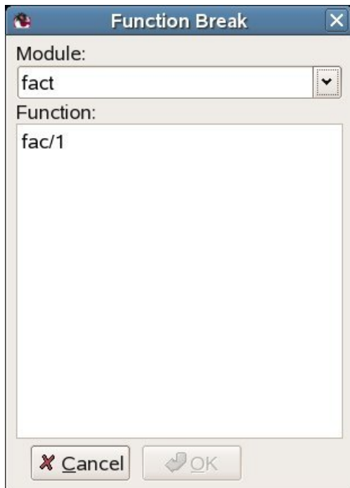
Figure 1.3: The Function Break Dialog Window.

A function breakpoint is a set of line breakpoints, one at the first line of each clause in the given function.