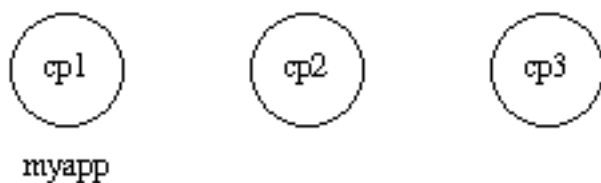
Figure 9.1: Application myapp - Situation 1

When all nodes are operational, myapp can be started. This is achieved by calling application:start(myapp) at all three nodes. It is then started at cp1 , as shown in the following figure: