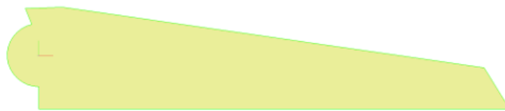
Figure 2: Composite Wing Example

This example introduces the use of composite materials. Initially a composite wing frequency analysis is completed. This example will grow to introduce design optimization with composites, including design variable linking.