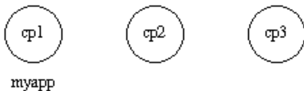
Figure 9.1: Application myapp - Situation 1

When all nodes are operational, myapp can be started. This is achieved by calling application:start(myapp) at all three nodes. It is then started at cp1 , as shown in the following figure: