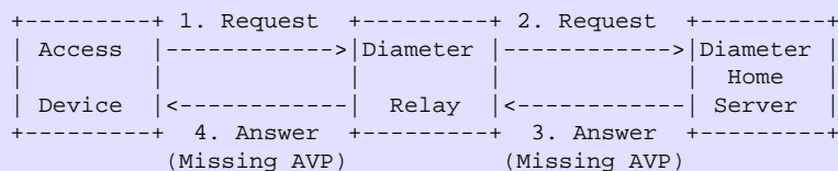
Figure 8: Example of Application Error Answer Message

Figure 7 provides an example of a message forwarded upstream by a Diameter relay. When the message is received by Relay 2, and it detects that it cannot forward the request to the home server, an answer message is returned with the 'E' bit set and the Result-Code AVP set to DIAMETER_UNABLE_TO_DELIVER . Given that this error falls within the protocol error category, Relay 1 would take special action, and given the error, attempt to route the message through its alternate Relay 3.