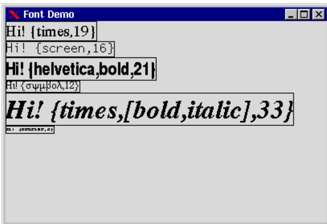
Figure 5.1: Font Examples

When programming with fonts, it is often necessary to find the size of a string which uses a specific font. {font_wh,Font} returns the width and height of any string and any font. The following example illustrates its usage: