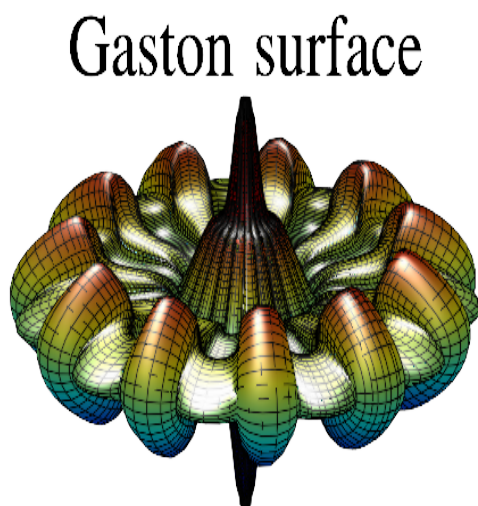
Figure 2: Gaston's surface: Three-dimensional parametric surface

\begin{figure}[!ht] \centering \mglgraphics[height=9cm,width=9cm]{Gaston_surface} \caption{Gaston's surface} \end{figure}