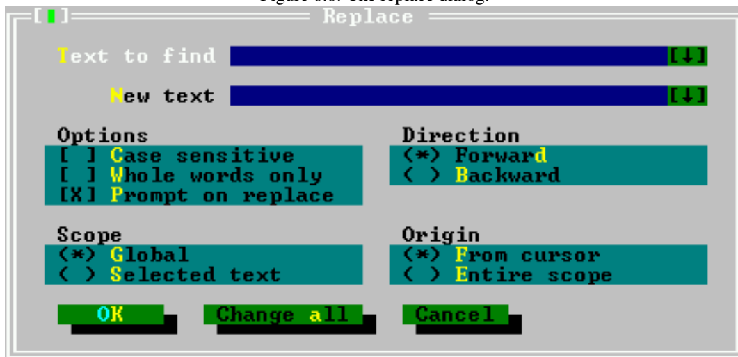
Figure 6.8: The replace dialog.

In this dialog, in addition to the things that can be entered in the search dialog, the following things can be entered: