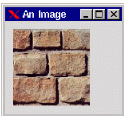
Figure 8.7: Canvas Image Object

The canvas image object displays images and moves them around in a simple way. The currently supported image formats are bitmap and gif.